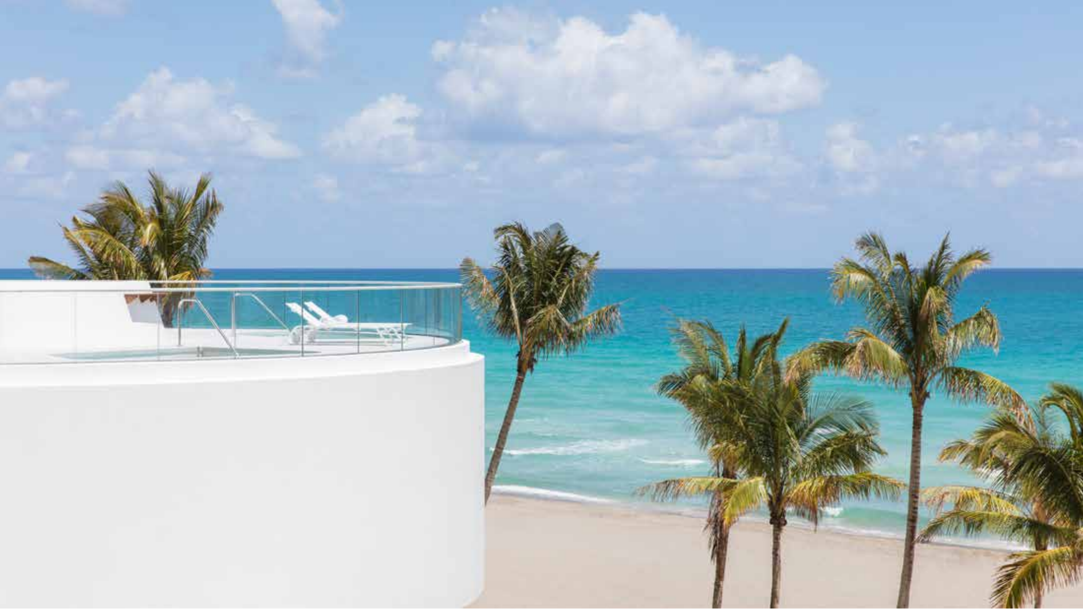
Beach View from Water Therapy Terrace