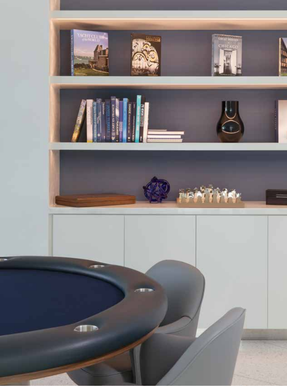
Entertainment Lounge-Poker Room