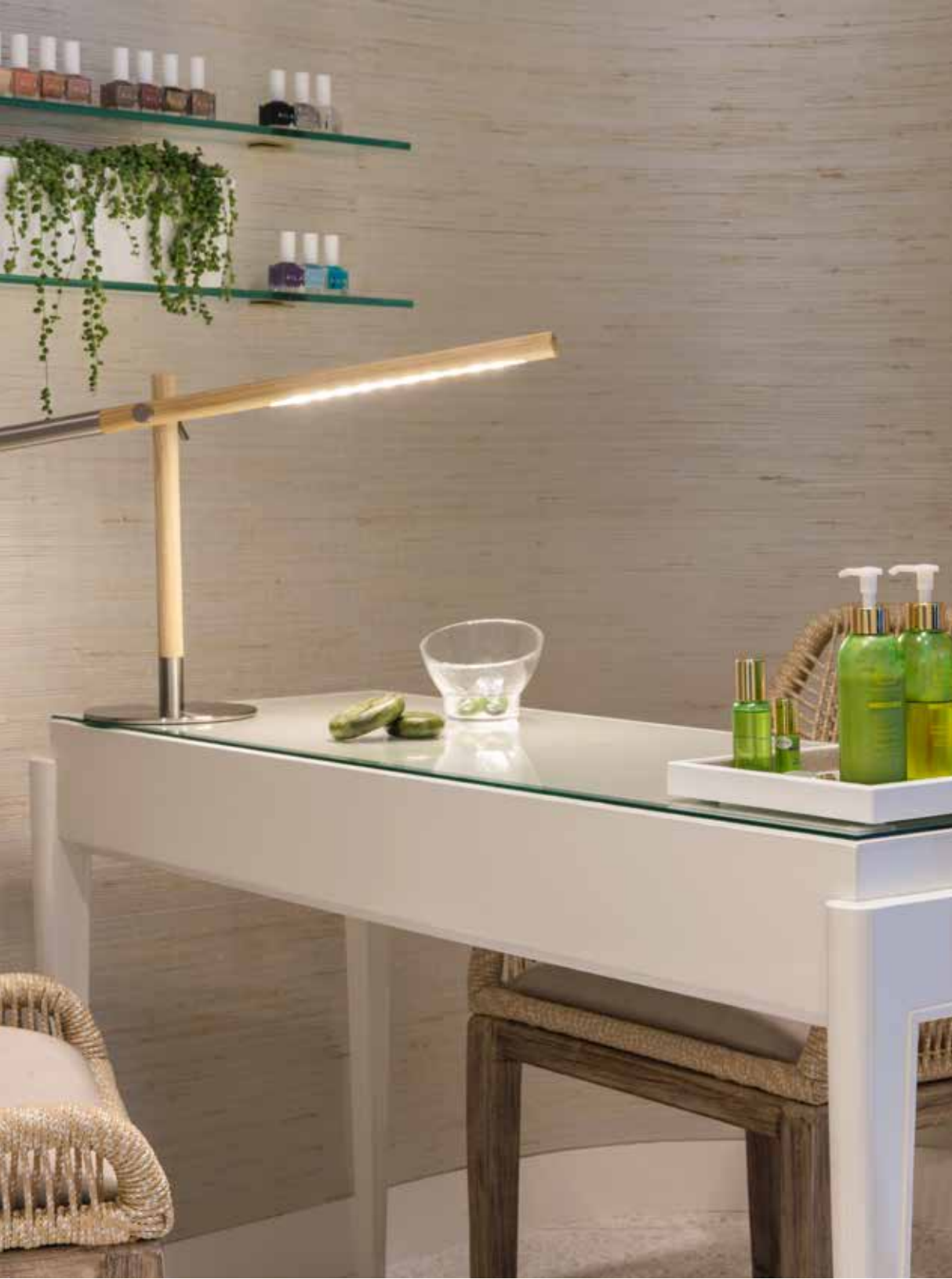
Tata Harper Manicure Station