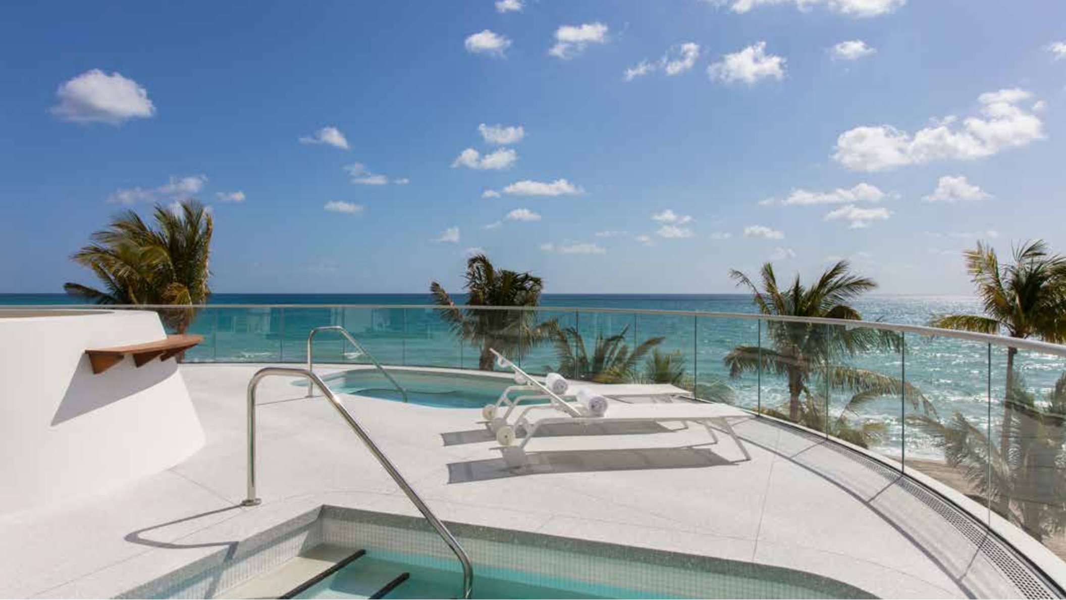
Wellness Center Water Therapy Terrace