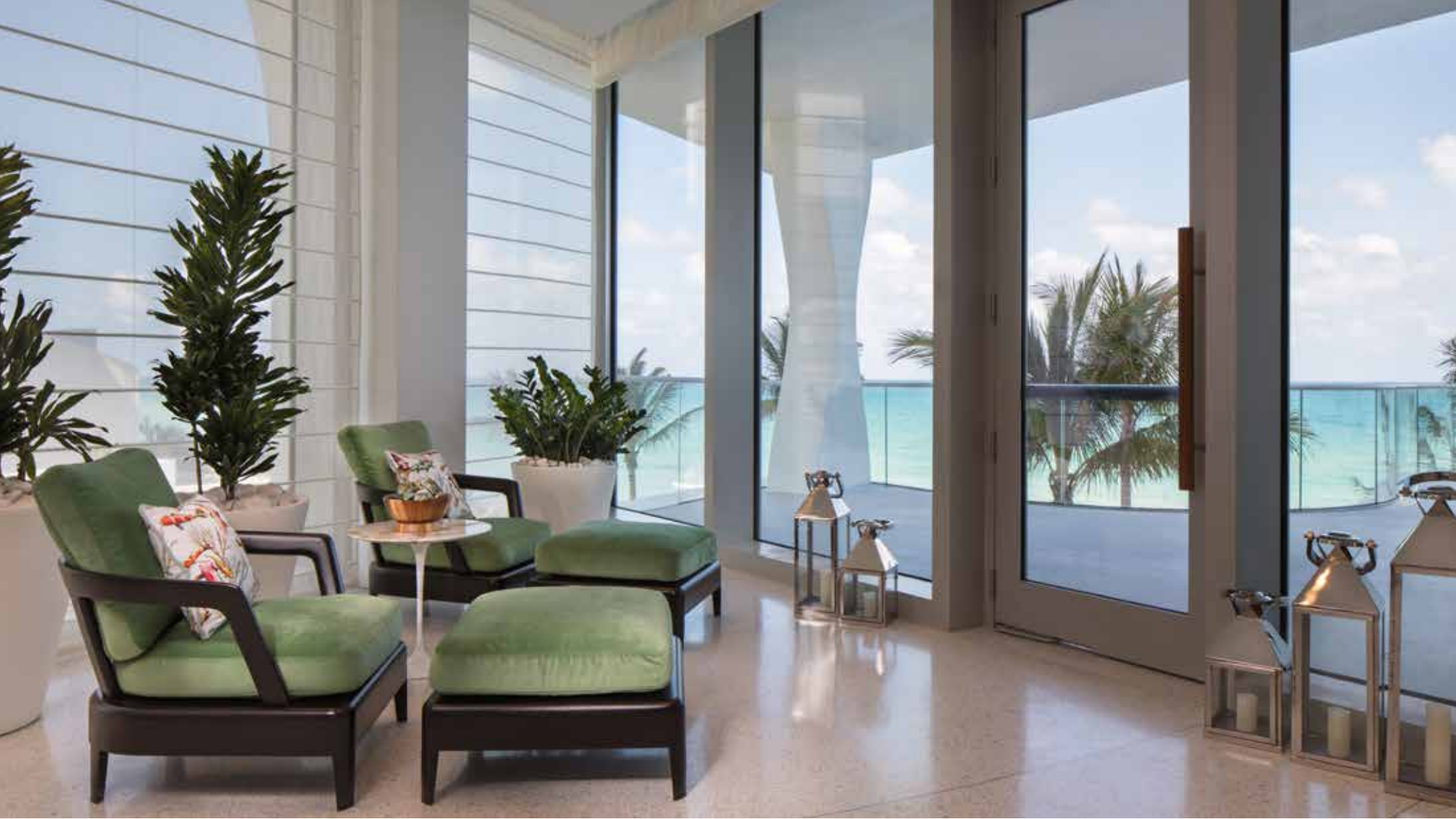
Spa Relaxation Room Ocean View