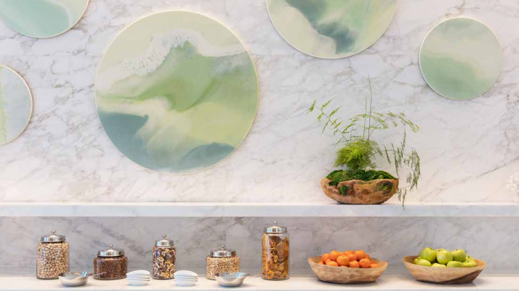
Wellness Center Refreshment Area