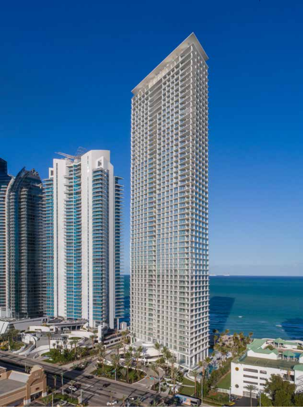
Jade Signature South East Profile