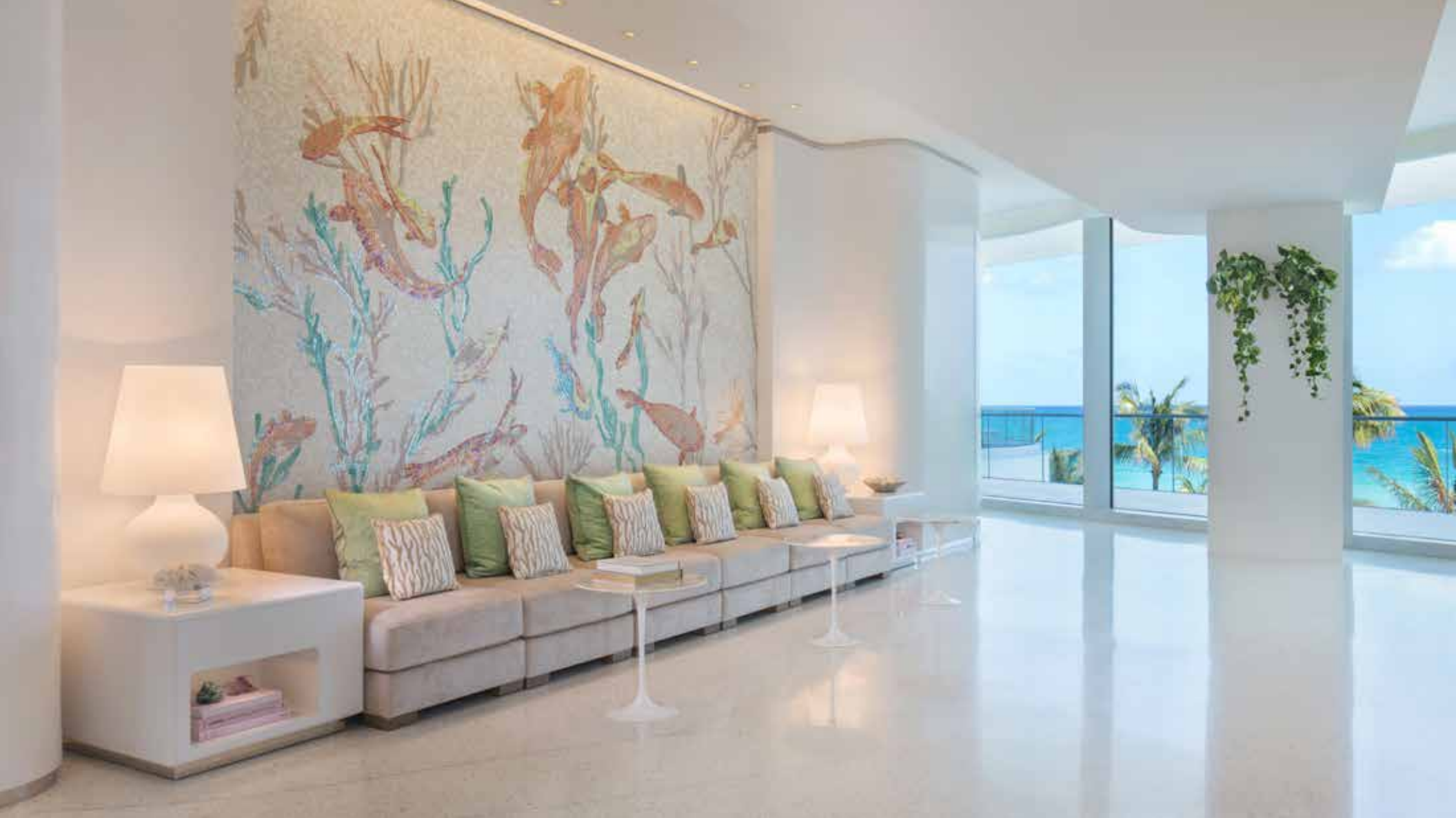
Wellness Center Reception Seating Area