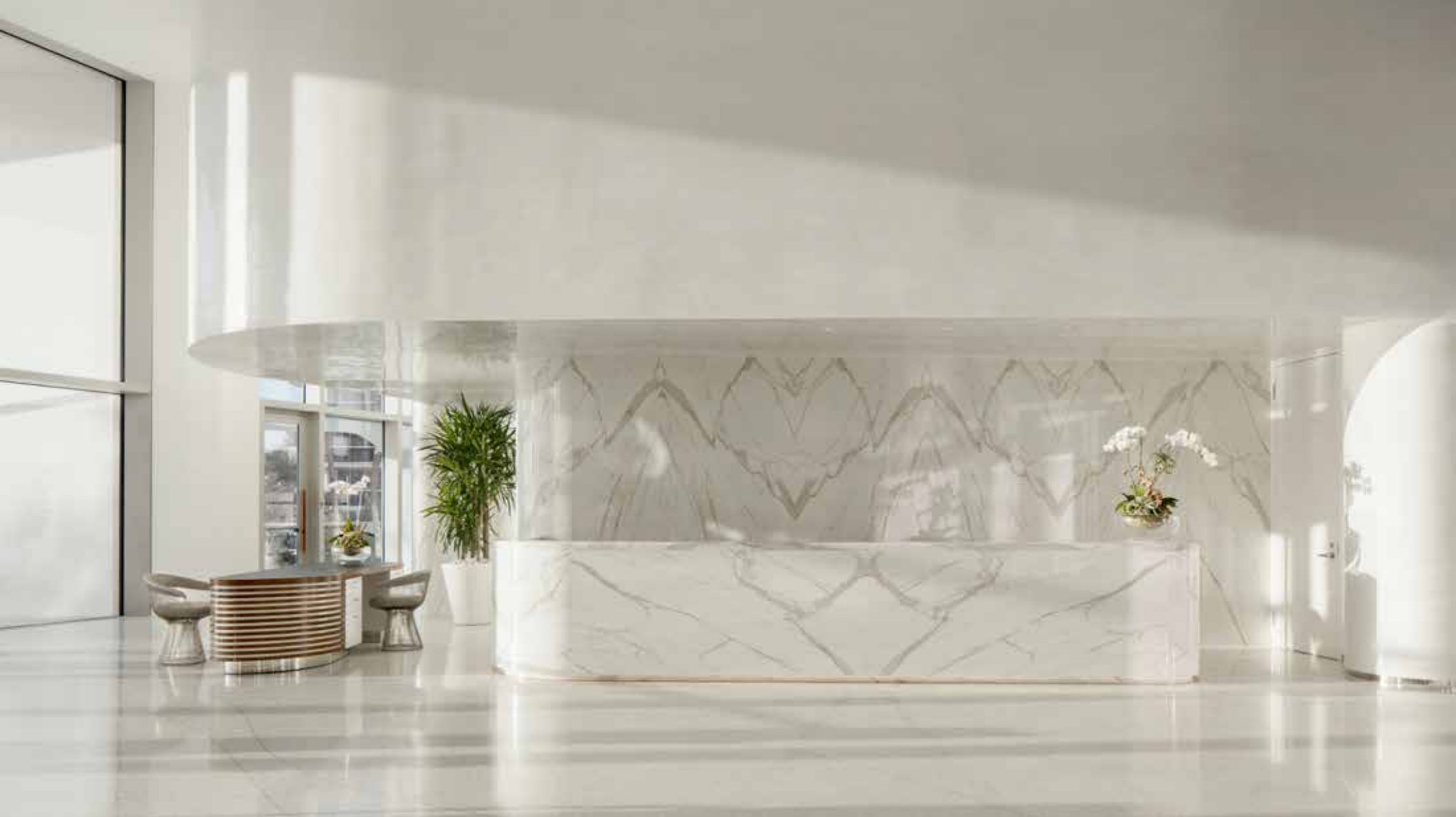
Lobby Reception & Concierge