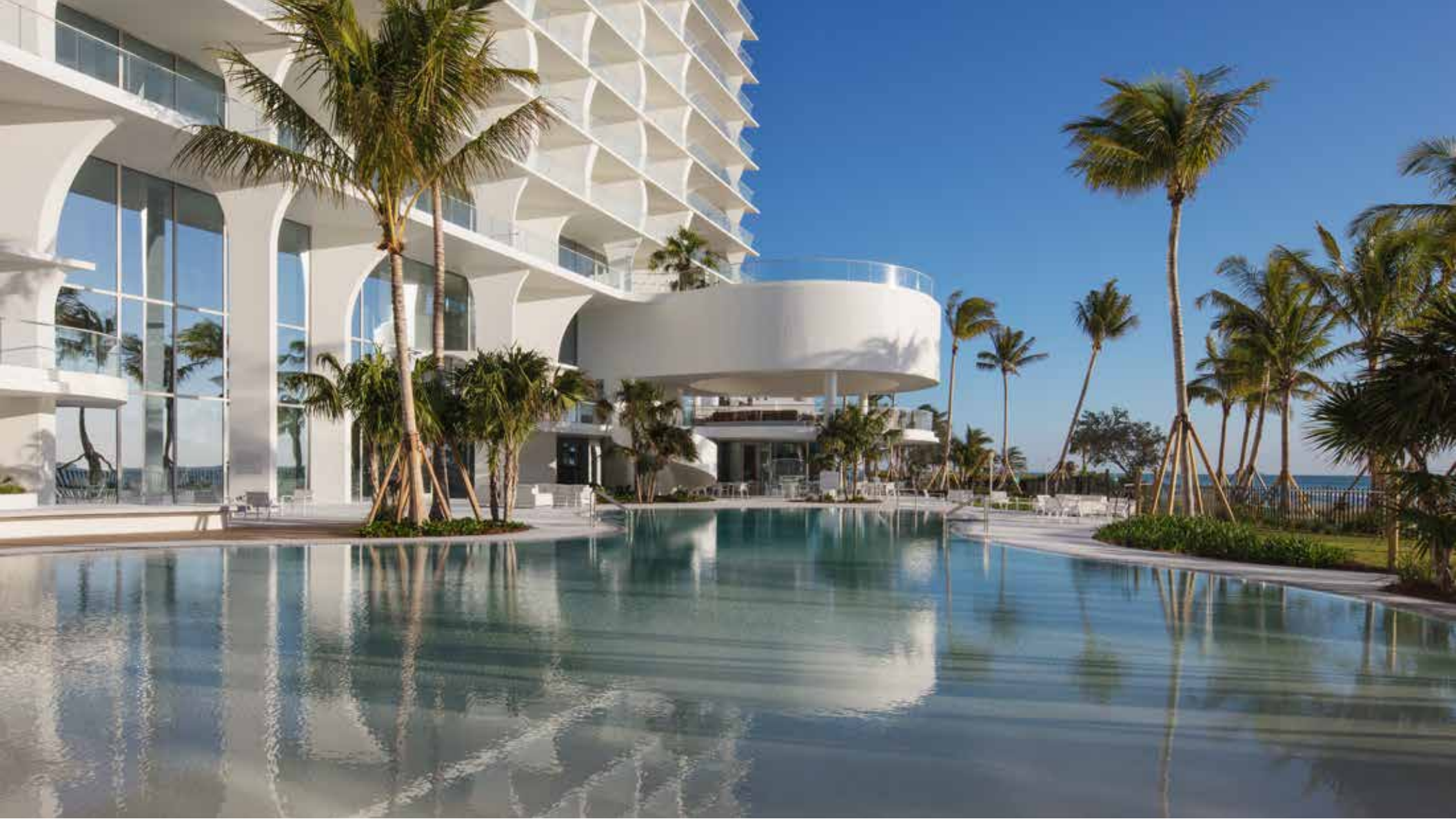
Zero Entry Pool