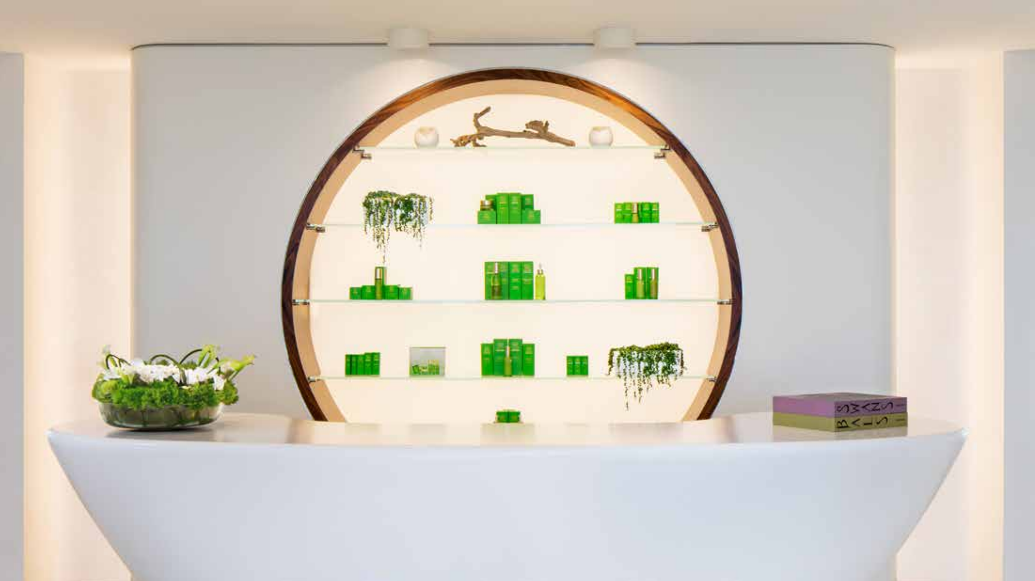
Wellness Center Reception Desk