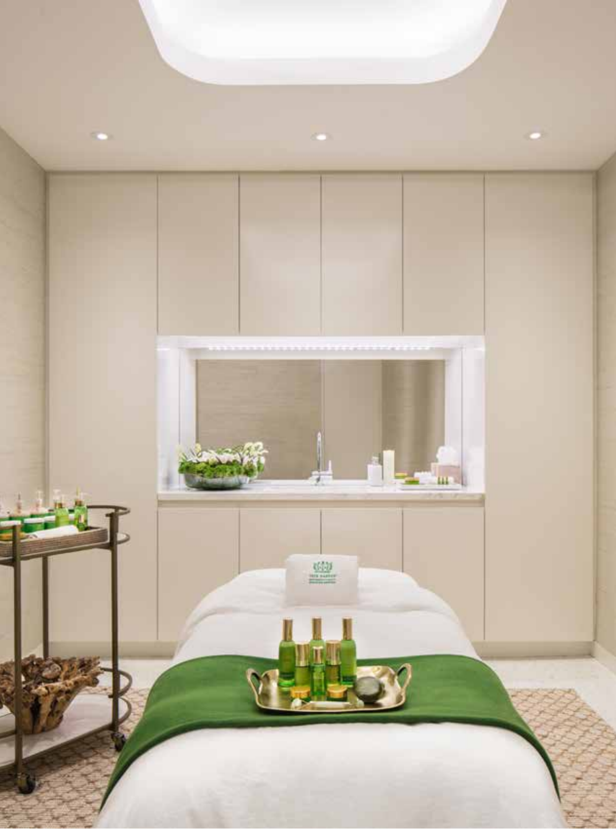
Tata Harper Spa Treatment Room