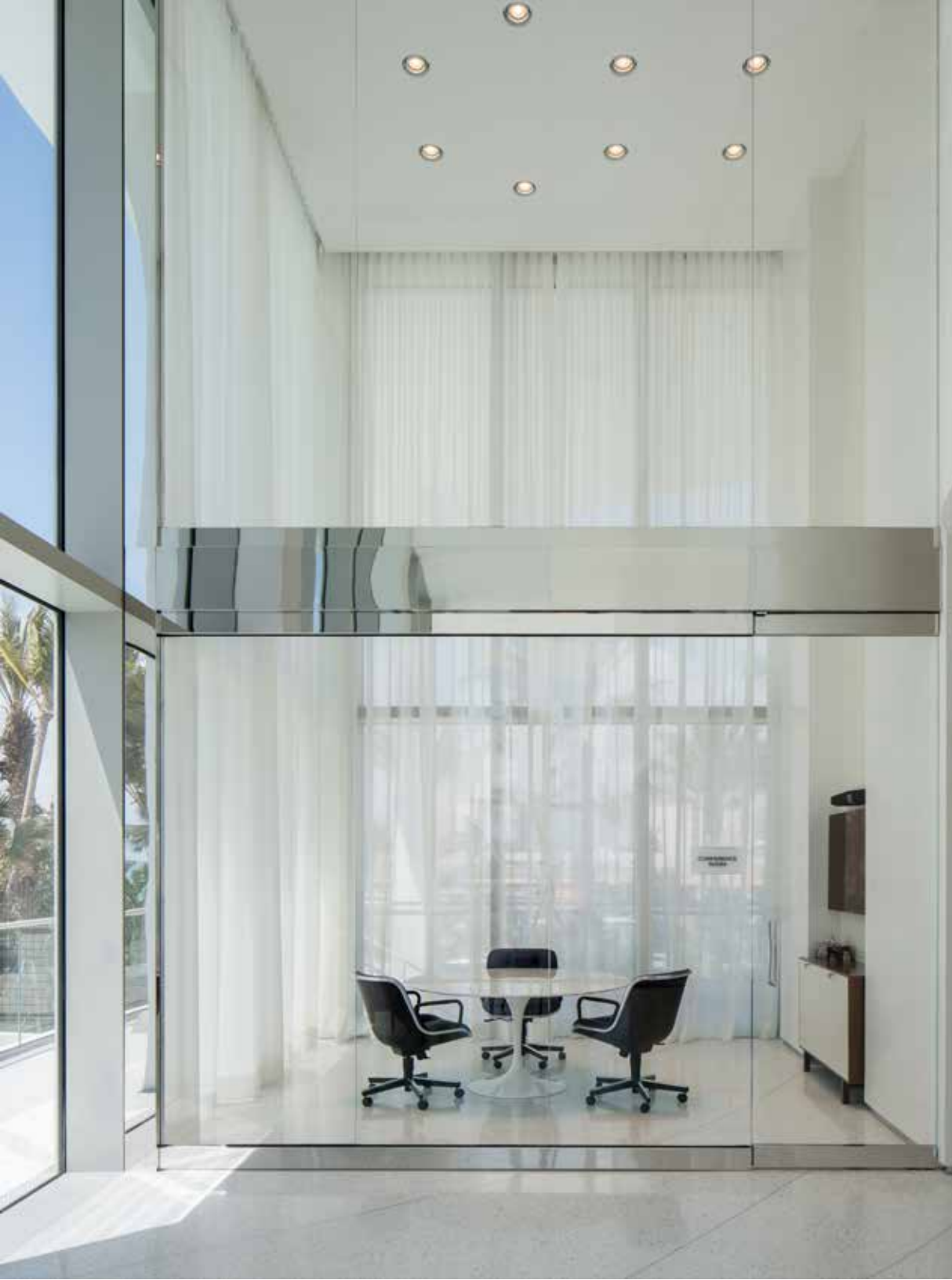
Business Center Conference Room