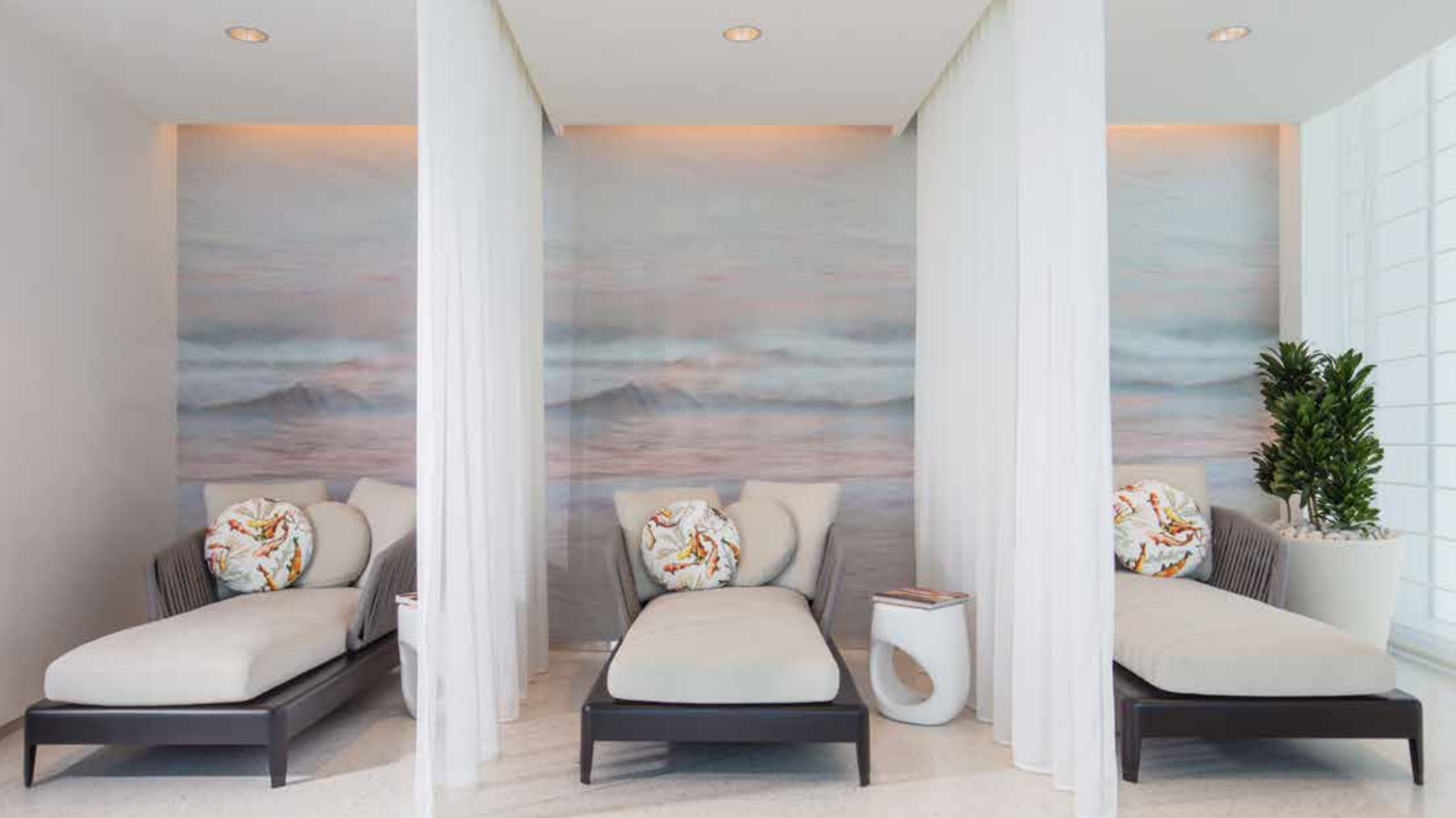
Spa Relaxation Room