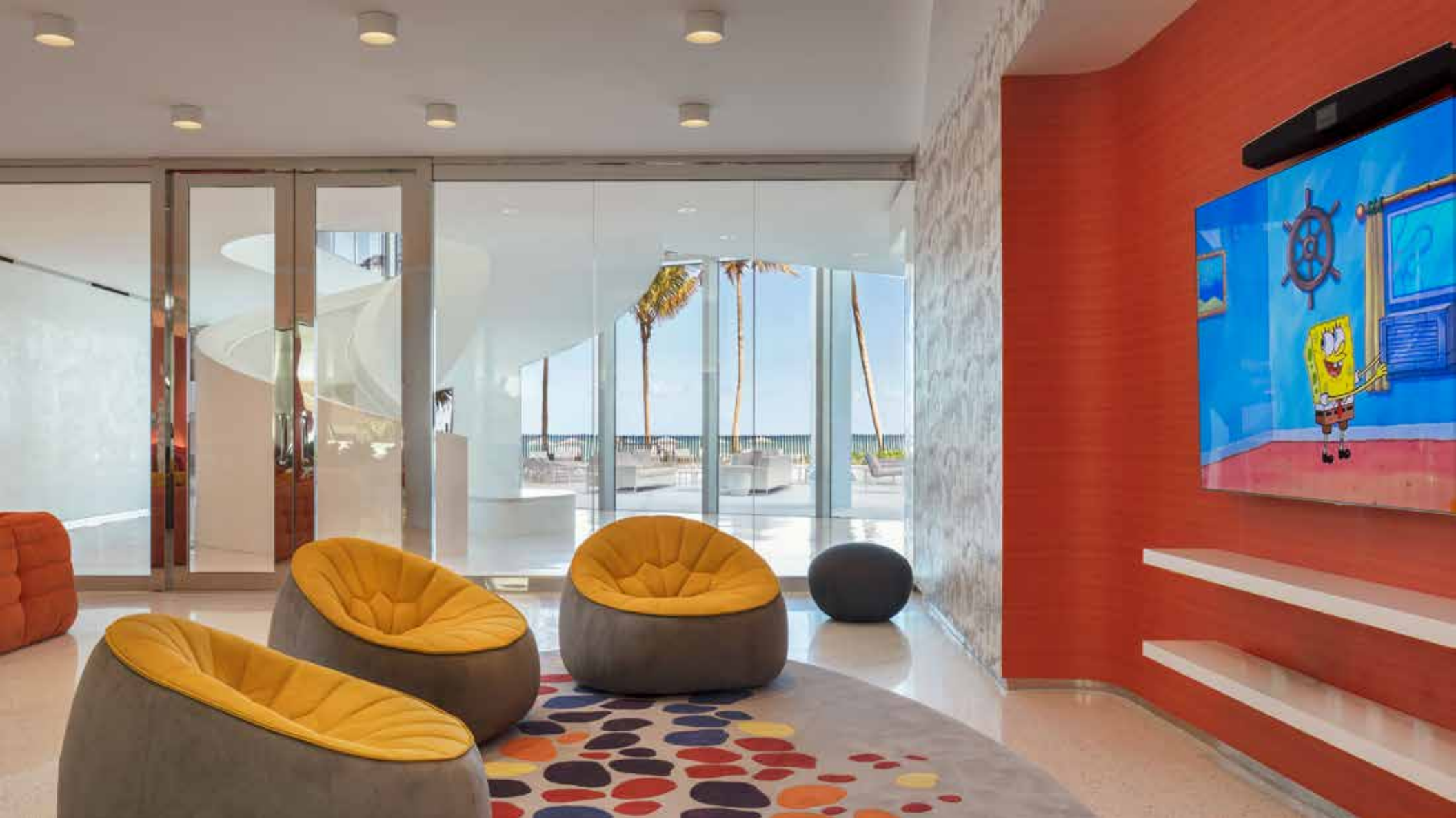
Teen's Tech Lounge