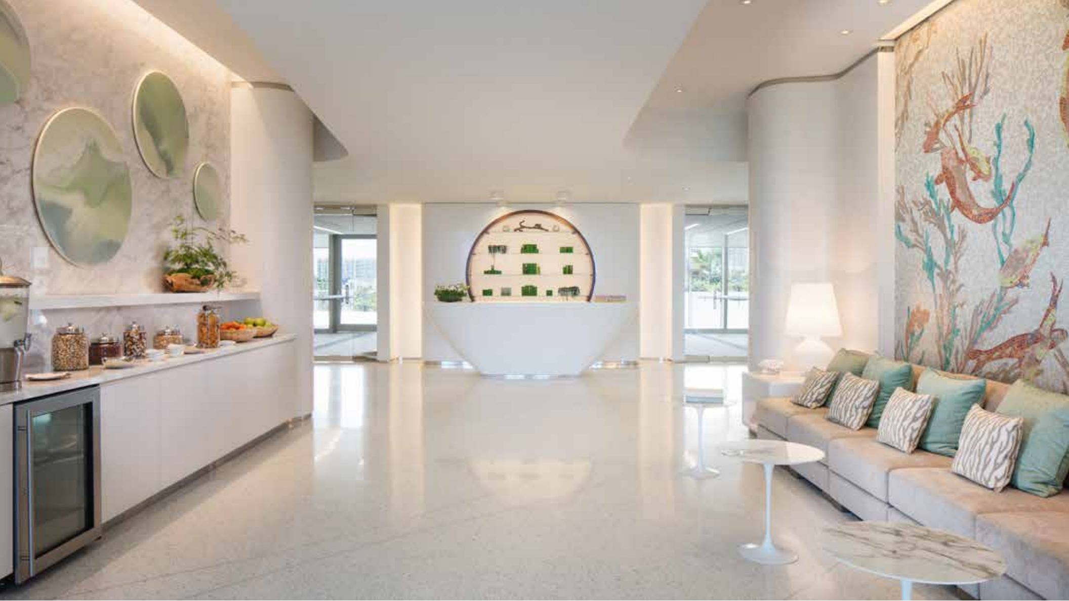
Wellness Center Reception