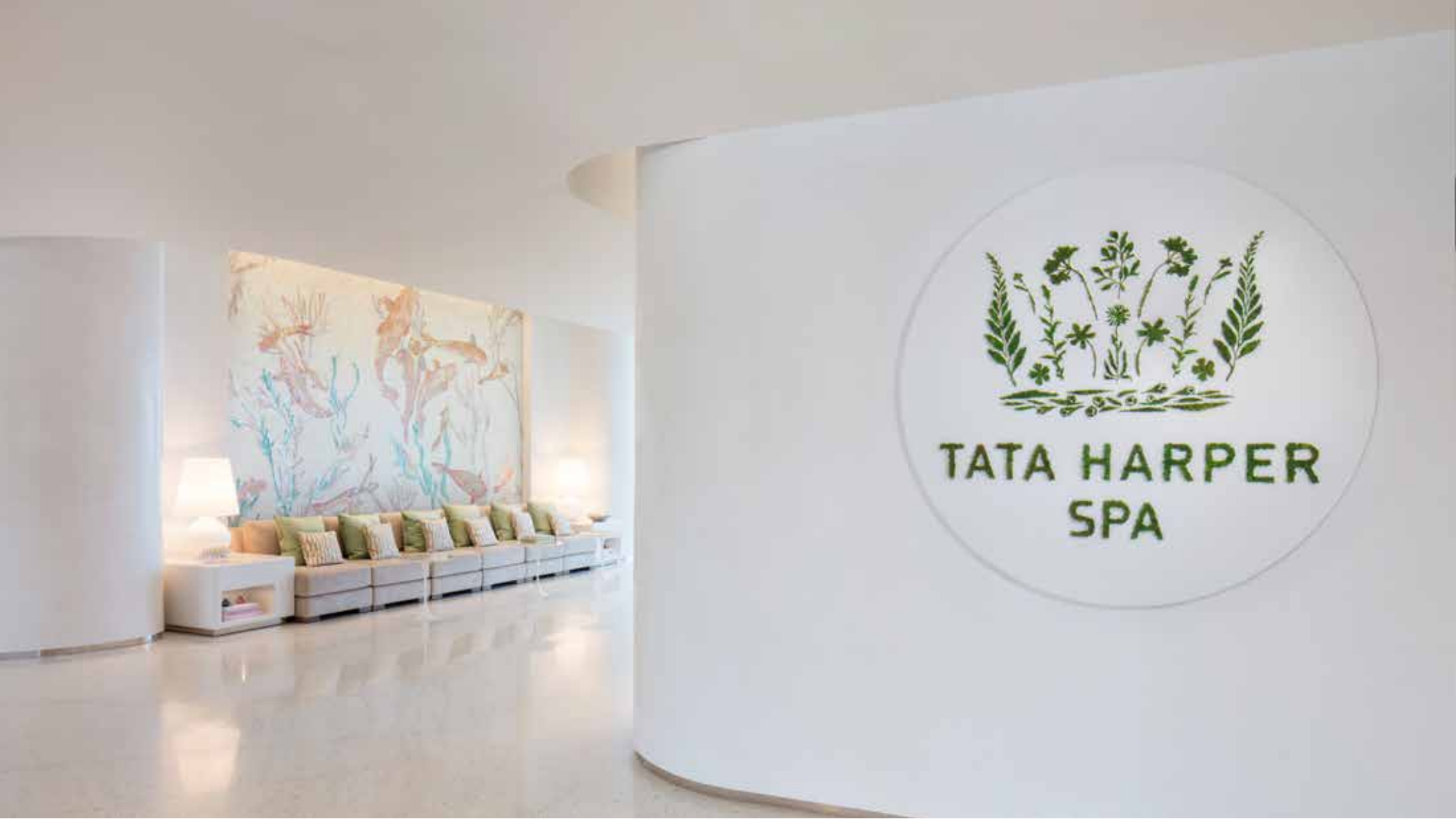
Tata Harper Spa at Jade Signature