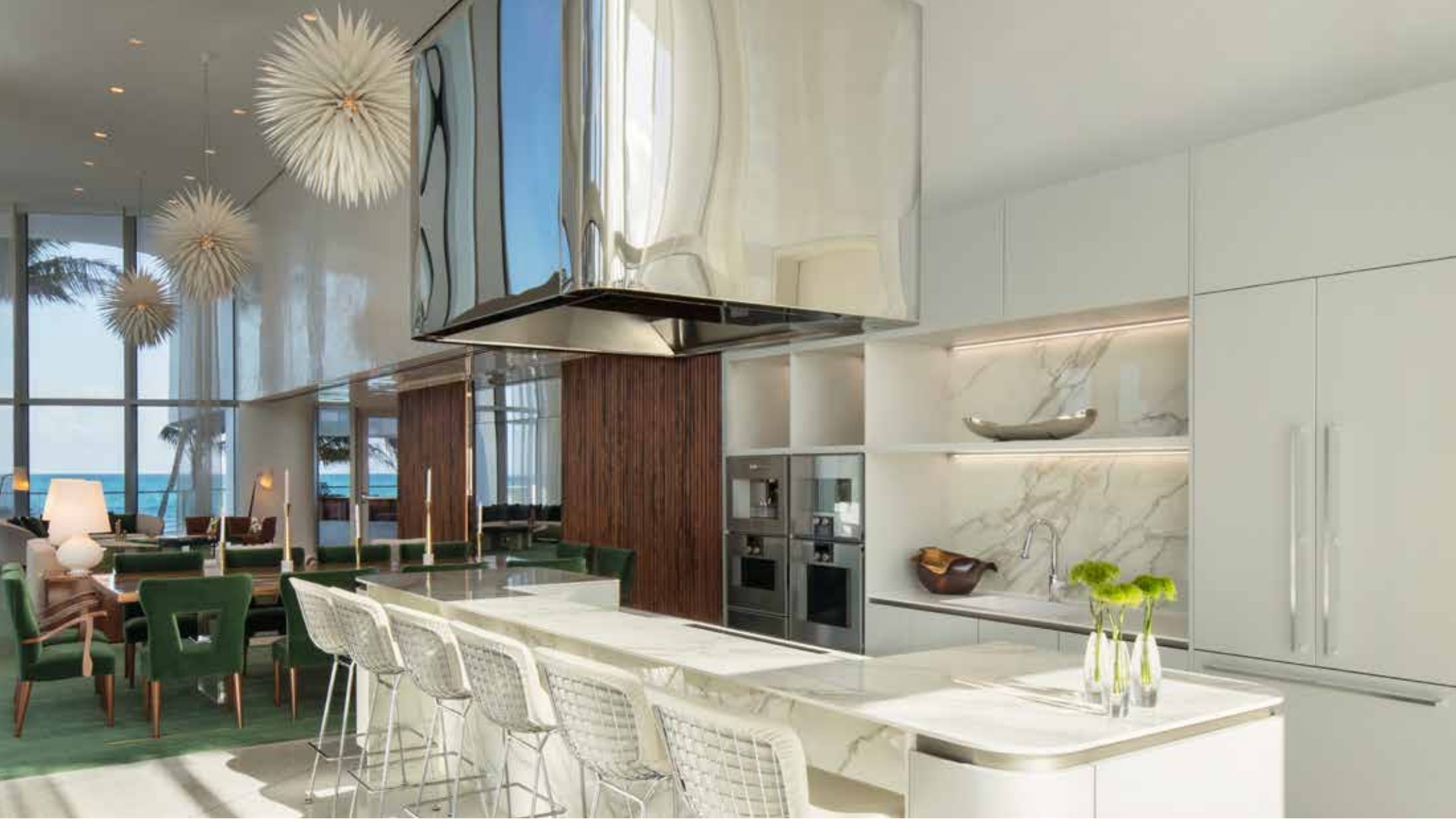
Clubroom Demonstration Kitchen