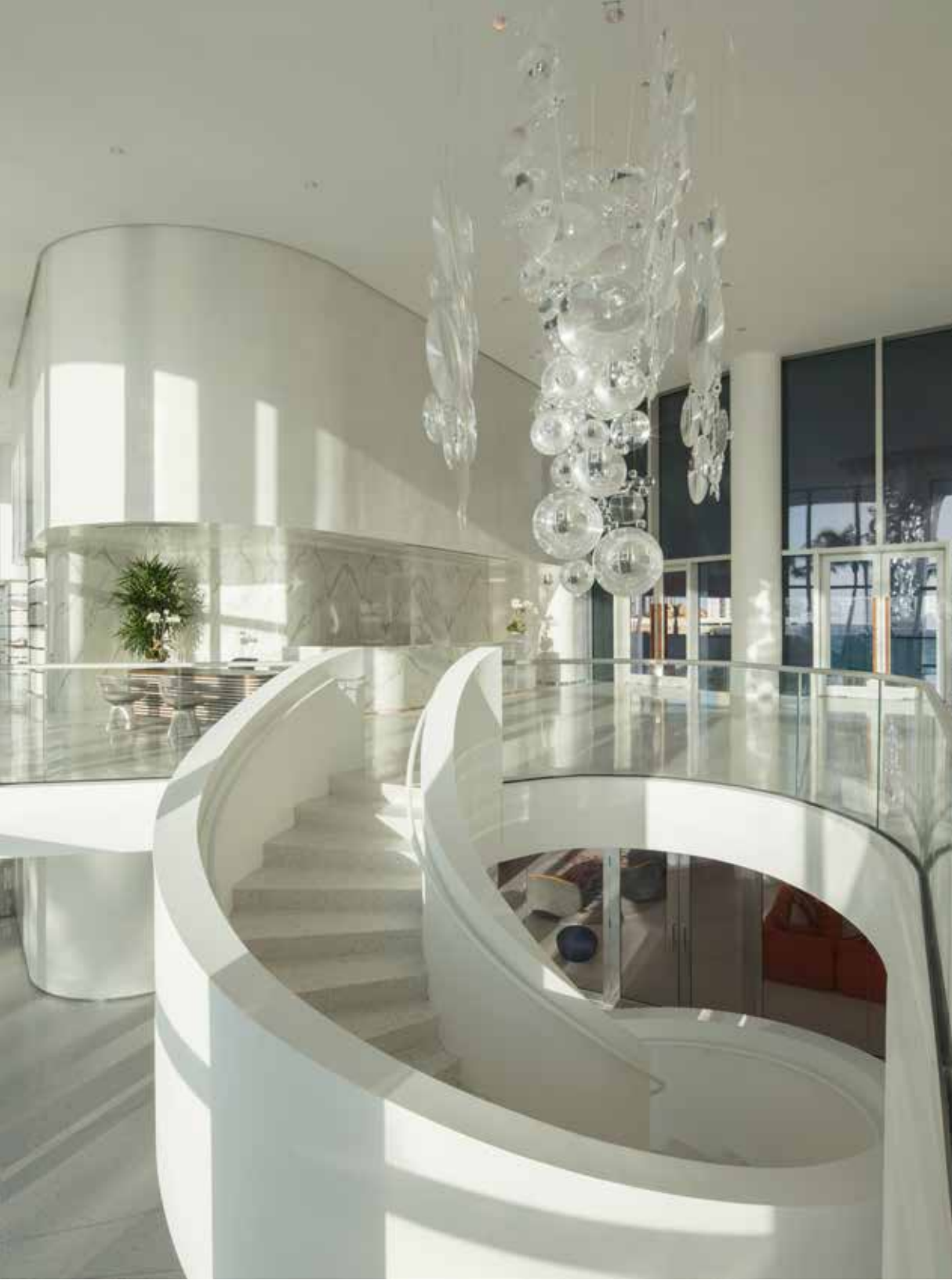
Lobby Grand Staircase